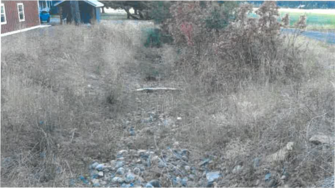
Above and below: Type N/4 stream along west side of existing home & shop.