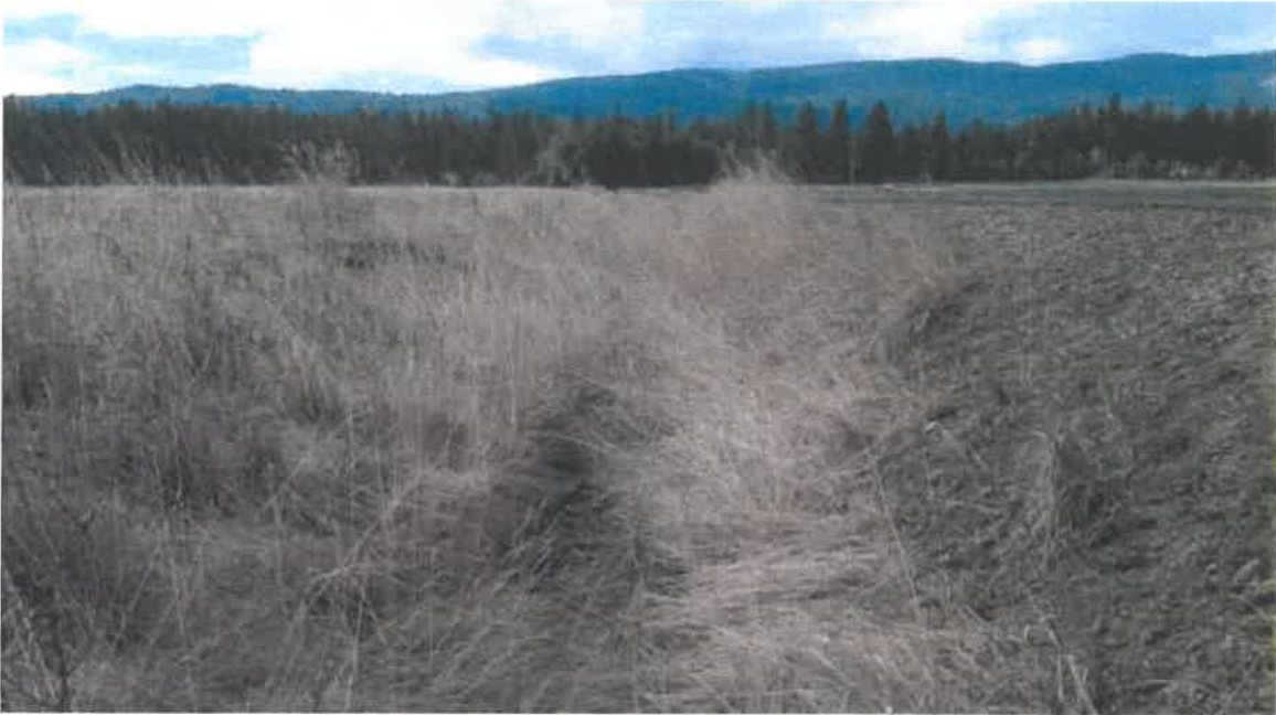
Above: Type N/4 stream along west side of site