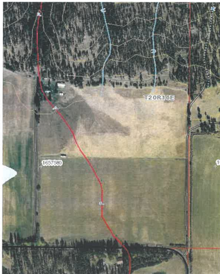
Above: WADNR Fpars stream mapping

The Washington Department of Natural Resources Fpars stream type mapping website depicts two (2) unclassified streams draining from the north edge of the site towards the pasture.