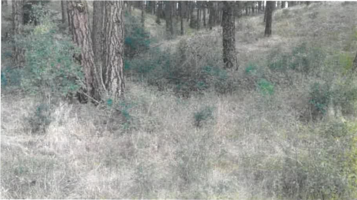
Above and below: Areas identified as unclassified streams on Fpars, no streams exist in these areas.