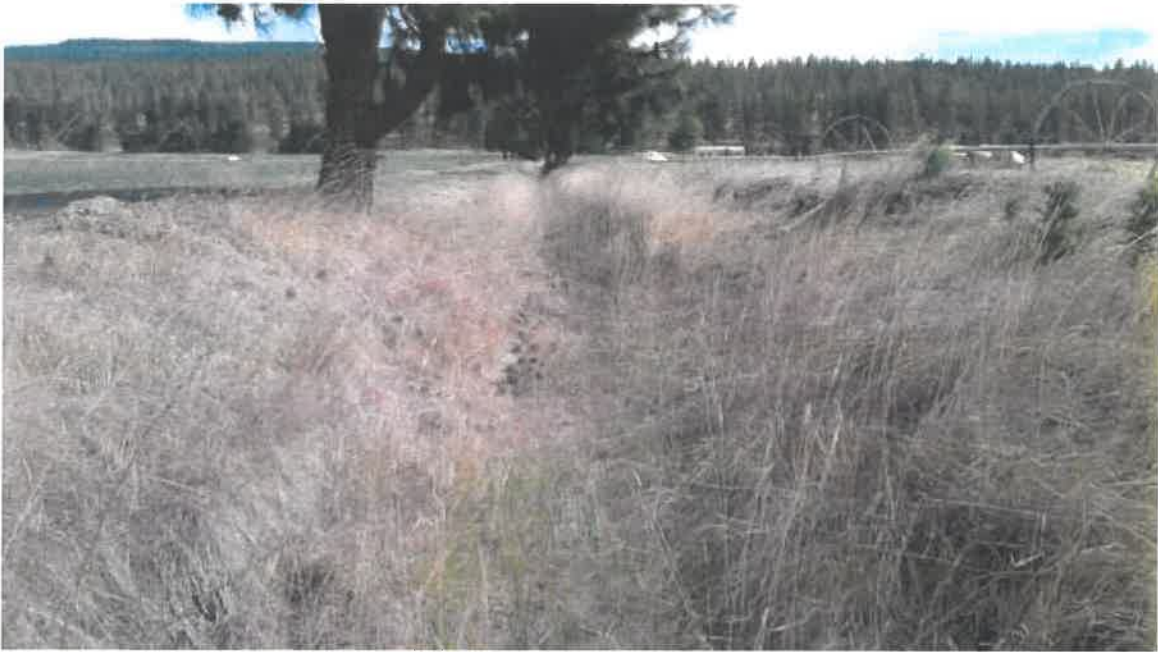
Looking north and south along Type N/Type 4 stream channel on east side of driveway.