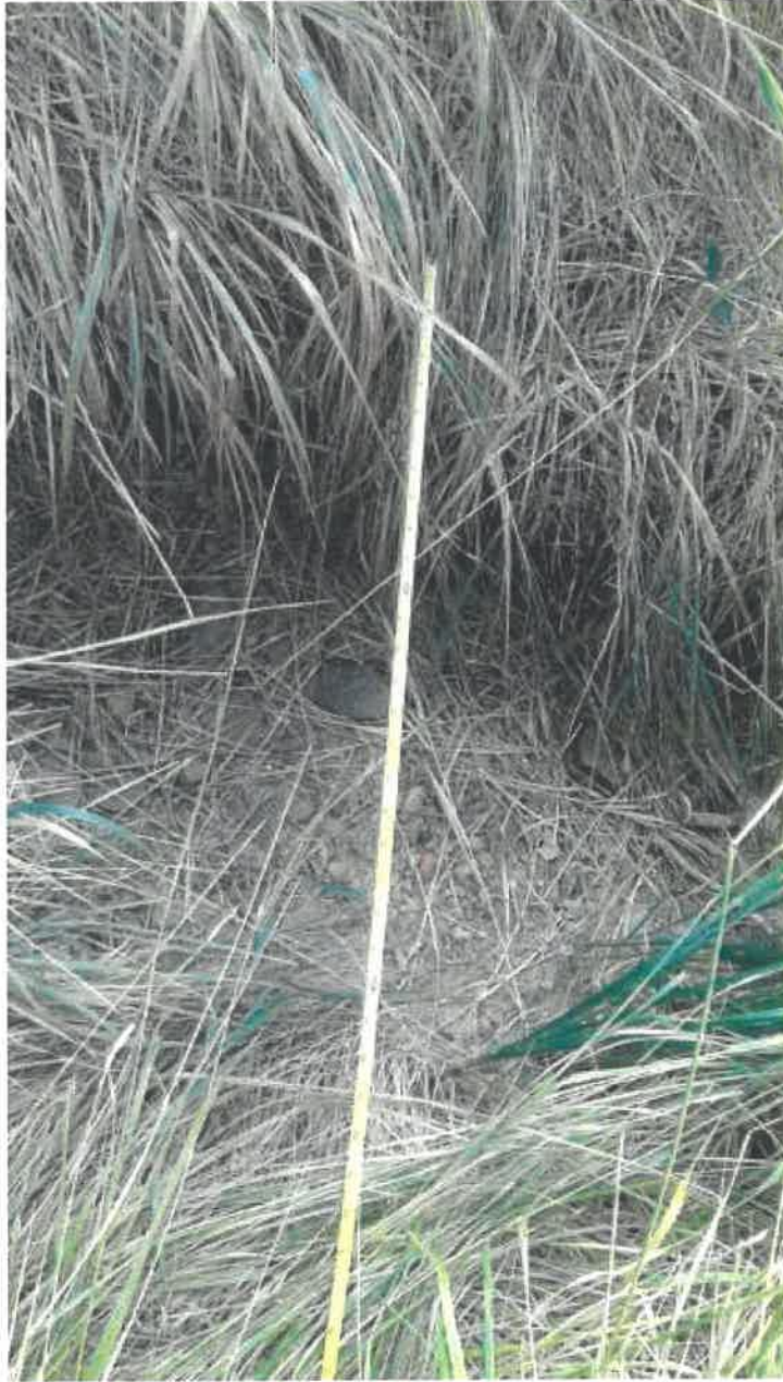
Above: Type N/4 channel bottom.