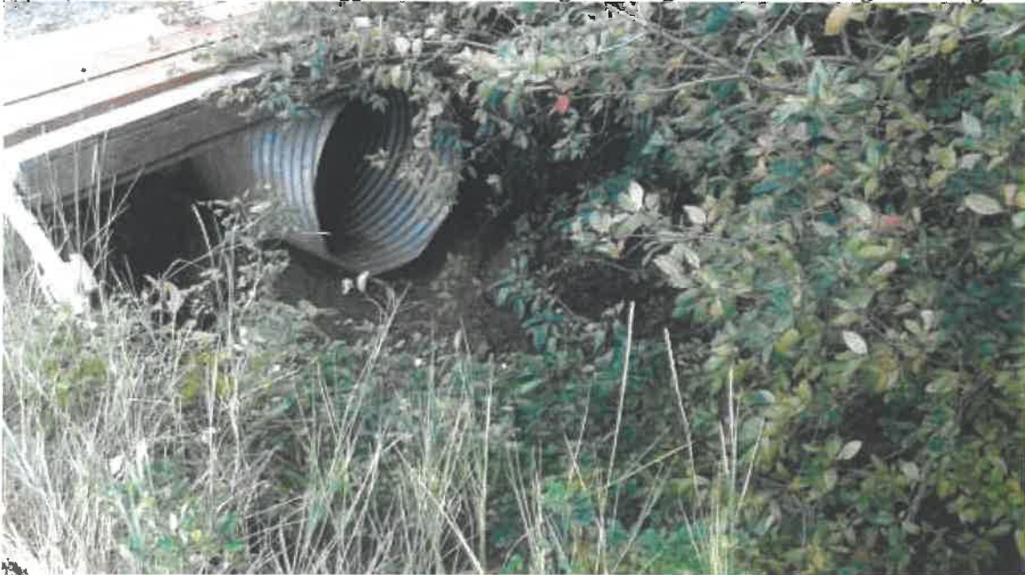
Below: Perched culvert in Type N/4 stream by existing home driveway crossing.